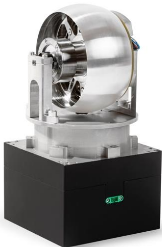
Figure 2: VEOWARE microCMG

VEOWARE developed a unique scalable-by-design micro-Control Moment Gyroscope (microCMG) , miniaturizing technology that has traditionally been adopted for larger satellites, reducing maneuvering time for small satellites, therefore improving productivity in space for any missions in Earth Observation, Communication, Space Situational Awareness, and In-Orbit Servicing.